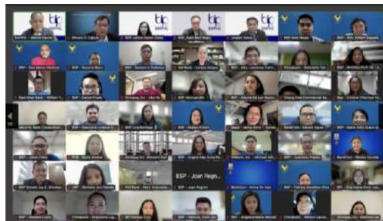
Good Corporate Governance: Bridging Values, Ethics and Integrity (Conducted online via Zoom last June 26 – 27, 2025)