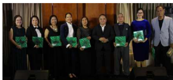
Committee Teamwork – 33rd BAPHIL Convention Committee