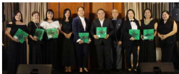
Committee Teamwork – Program & Attendance Committee