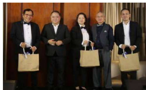
Representatives from the Bangko Sentral ng Pilipinas, Philippine Deposit Insurance Corporation, and Development Bank of the Philippines received the Institutional Award.