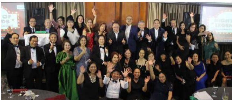
BAIPHIL members and guests strike a wacky pose to cap off the event with fun and energy