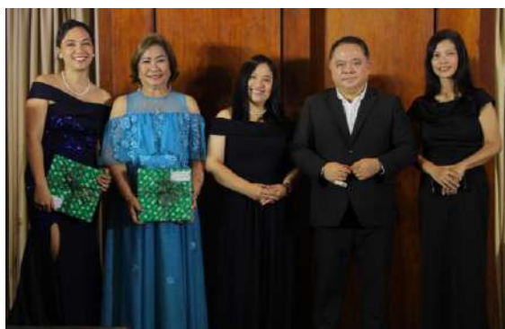
Committee Teamwork – Risk Management Course Committee