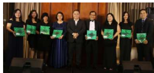
Committee Teamwork – Governance, Legal, Regulatory, & Compliance Course Committee

Chairperson, Governance, Legal, Regulatory & Compliance Course Committee Deputy Governor Corporate Services Sector Bangko Sentral ng Pilipinas