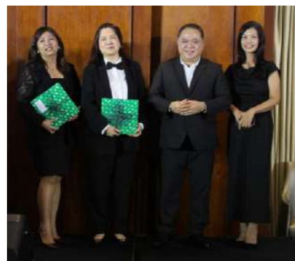
Committee Teamwork – Corporate Communications & Information Exchange Committee