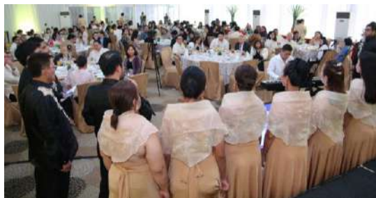
A special musical performance by the BSP Singers entertained guests during lunch