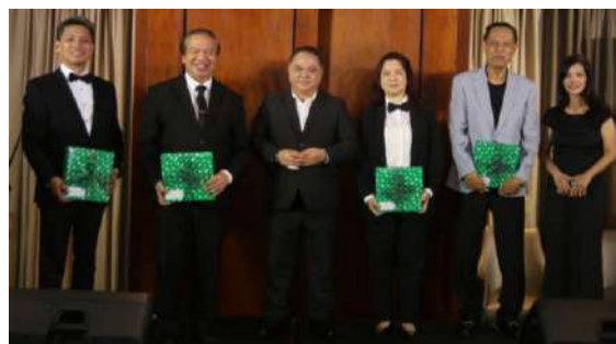
Committee Teamwork – Products, Bank Operations & Management Course Committee