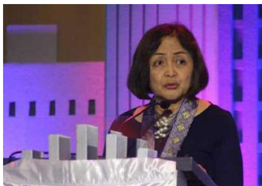
Opening keynote address delivered by Deputy Governor of the Financial Supervision Sector of Bangko Sentral ng Pilipinas Chuchi G. Fonacier on Day 2, featuring "Charting the Path Forward: Balancing Innovation, Consumer Protection, and Sustainability in Modern Banking."