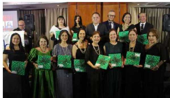
Committee Teamwork – Special Projects Committee